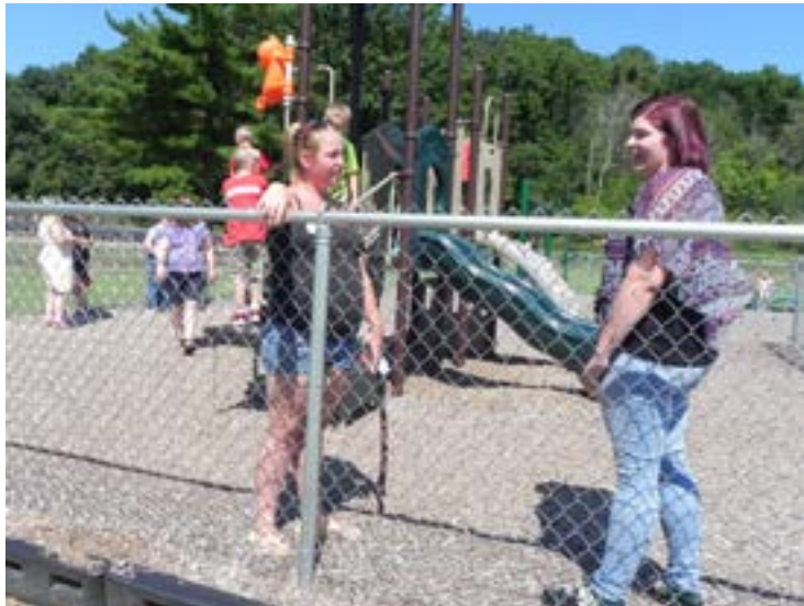
Our Kinder play dates have been a big hit with families who have registered their Kinders with us. It's been a great time for parents and children both to meet in advance of school. Our hope is that first-day jitters are minimized. We've had three so far, but you can still attend our last one on August 10th, from 10:30 to noon. The Mom-to-Mom clothing and used uniform sale will also be underway!